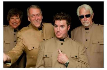
WONDERWALL THE TRIBUTE